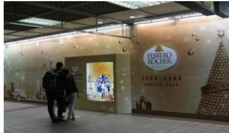
AR & 4K Video Advertising