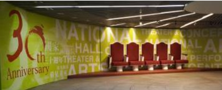
Exhibition at the Chiang Kai-Shek Memorial Hall Station