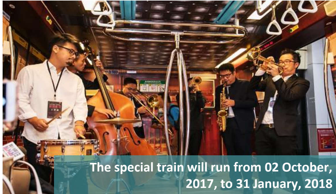
The special train will run from 02 October, 2017, to 31 January, 2018