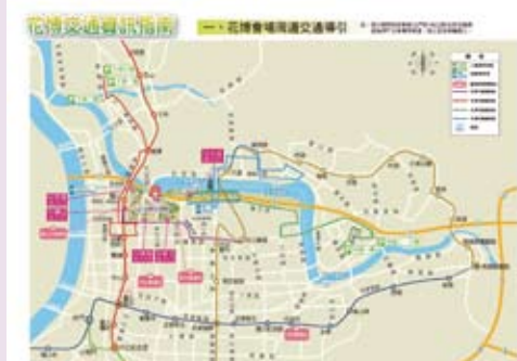
Transportation information for the Taipei International Flora Expo area