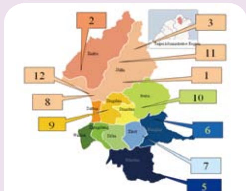
Figure 1 : Citizen Mini Bus Route Distribution Map