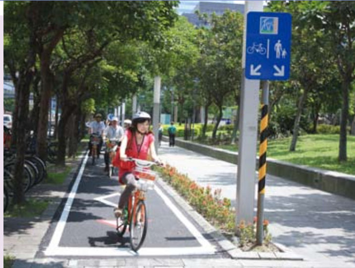
Songzhi Road Bike Lane in Xinyi District.

In December 2009, the Water Park under the Taipei Water Department began to carry out the Gongguan Riverside Bikeway Network Plan. In 2010, the plan was extended to the Treasure Hill community and then further expanded to include the bicycle loop route and Hakka Park. Bicycle guide signs were also installed to further improve the quality of the bicycle route network.