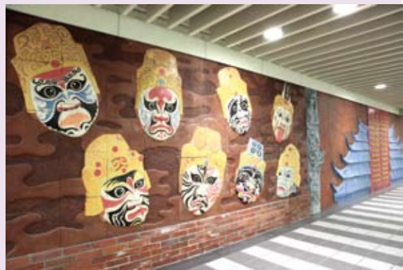
Art at MRT Xingtian Temple Station: Peace and Prosperity.