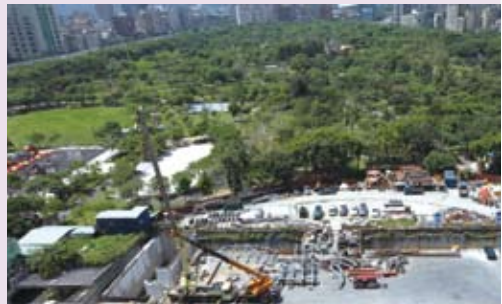
A suspended light tower display at MRT Da'an Park Station on the Xinyi Line.