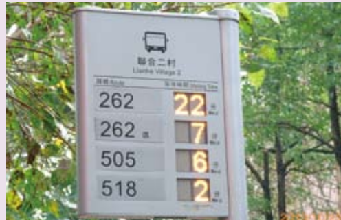
New bus stop signs display arrival times.

In December 2009, the Taipei Joint Bus System completed the city-wide establishment of the city-wide Taipei e-Bus System. The service will be expanded and improved. It will also be integrated in future with New Taipei City, Taipei City and highway passenger bus positioning systems. The integrated system will provide the public with more reliable and complete information on bus positions. The Taipei City Government also aims to increase ridership and rider satisfaction through stronger promotion of this convenient service.