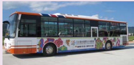
A hybrid low-floor bus

As of the end of 2010, 602 low-floor buses were in service in Taipei. Moreover, in conjunction with the Flora Expo, the Taipei City Government has added 60 hybrid low-floor buses to transport expo visitors. The city government also will continue to promote the use of low-floor buses and other barrier-free means of transportation.