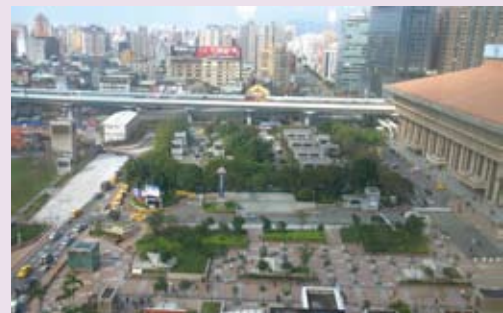
After Improvements: Taxi lines at the west side of the station have been moved underground.

To resolve the taxi line problem, the Taipei City Department of Transportation moved the taxi waiting area from the ground-level area by the East 3 entrance to an underground waiting area at the underground parking lot on the west side of the station. Improvements to pedestrian signage at Taipei Main Station, now ongoing, will provide clearer and more accurate directions to pedestrians at the station area. The opening of the Taipei Bus Station is leading the Taipei Main Station area into a new era of development. Therefore, a comprehensive review and improvement plan has been formulated for the Taipei Main Station area. Moreover, the city and central government have jointly established a Taipei Main Station Overall Transportation Improvement Task Force to conduct a comprehensive and systematic review to improve traffic order around Taipei Main Station. The improvements will give priority to pedestrians first,