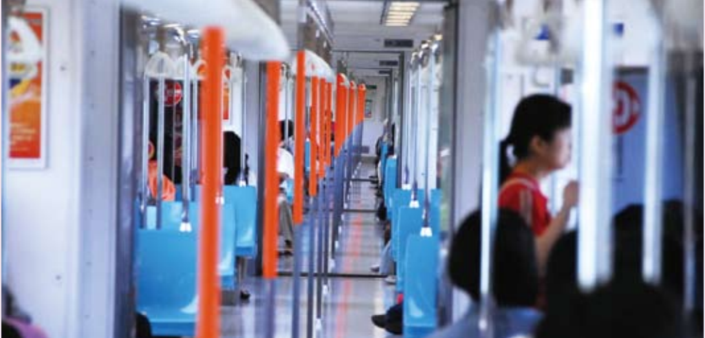
Hand poles in MRT cars are coated with reflective rubber.