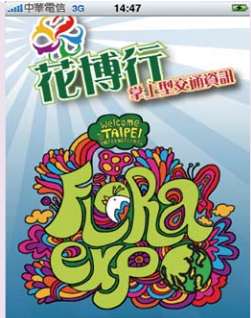
The downloadable "Go Flora Expo" smart phone application.

For people without smart phones, the Taipei City Department of Transportation also has added a "Flora Expo" section to the Taipei City ATIS Web, with mobile phone/PDA versions providing the same real-time traffic information.