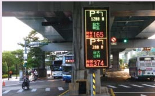
Parking information sign at the intersection of Jilong Road and Tingzhou Street.

The system was launched in 2009 and by the end of 2010 had been installed at 129 parking lots in Taipei. In future, the system will be expanded to all 12 of the city's administrative districts. The system will also be fully integrated with the Taipei City Traffic Engineering Office's changeable message sign (CMS) system so real-time parking and traffic information can be displayed at CMS points. This will improve transportation overall, upgrade the quality of road services, and bring parking policy into the e-generation.