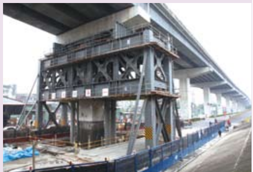
Groundwork for the P64 tower column on the MRT Airport Line.