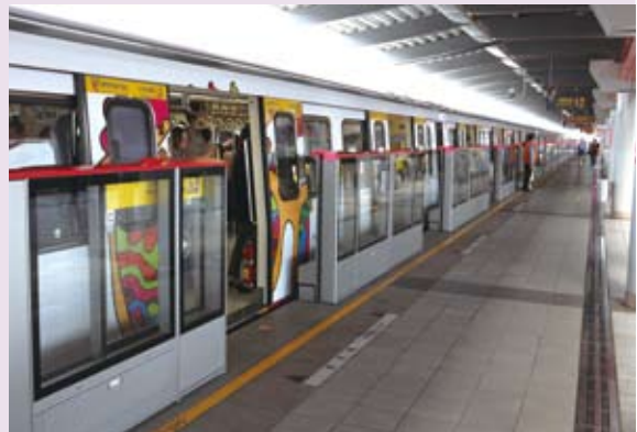
Newly added platform gates at Yuanshan Station.

Seating in the first and sixth cars of high-volume trains with stable bicycle volume was rearranged to make the MRT more convenient for passengers with bicycles. Since April 24, 2010, bicycles have been allowed on the MRT all day on weekends and national holidays to meet the