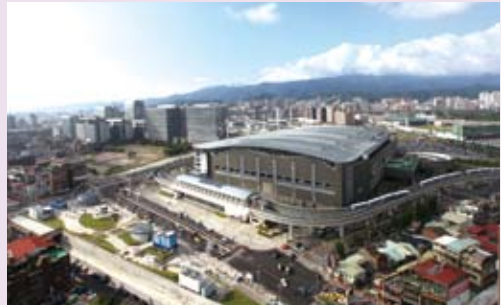
Aerial view of the MRT Nangang Exhibition Hall Station on the Nangang Eastern Extension.

The Dingpu Extension on the MRT Tucheng Line is 2 kilometers long and was 26.02% complete at the end of 2010. The extension is being developed under the Taipei MRT plan to meet transportation needs in the Dingpu area and industrial zones in the Tucheng vicinity. The project is also coordinated with the Executive Yuan approved Dingpu High-tech Industrial Park development plan in Tucheng. The extension