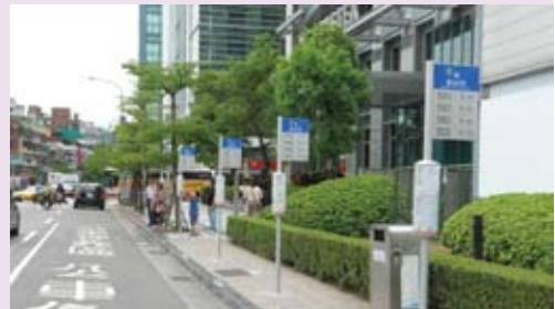
Flagpole-style intelligent bus stop sign.

In order to improve the city landscape, reduce the number of roadside signs, and improve the readability of current bus sign route maps, the old bus signs in Taipei City are being replaced with flagpole-style and centralized signs. On the flagpole signs, the sign surface has been made smaller by moving the route map to the sign pole. Each of the tubular poles can display four route maps. The poles are made of stainless steel with reinforcing plates that can spin for easier reading. The centralized signs have a lightbox design and can be connected to a power source. Each sign can display six route maps. The obverse side also can be used to display route guides or public service advertisements. The new signs show the bus stop name, routes served, and bus direction and terminal stops in both Chinese and English. In addition, six major stops for each route are listed in English for foreign visitors. In 2010, a total of 2,233 bus stop signs were replaced in Taipei and all signs in major city areas are expected to be replaced by the end of 2011. The new signs will replace the total number of bus stop signs from the original 5,800 to around 3,000, creating a more comfortable bus waiting and walking environment.