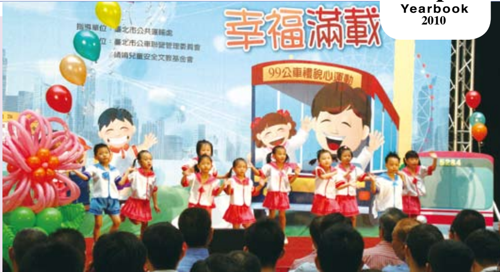
Press conference for the 2010 Bus Courtesy Campaign.

agency handling of fuel fees by convenience stores and inspection agencies. By the end of that year, those channels had handled a total of 175,590 payments for fuel fees (including violation fines) and compulsory insurance fines, for a total amount of NT$998,020,316. This has greatly improved the convenience of fee payment, while also reducing the administrative costs and increasing the work efficiency of the Taipei City Government.