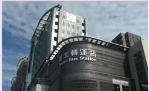
Taipei Bus Station

The Dunhua Bike Lane passes through the center of Taipei City along a north-south arterial, forming a cross-shaped network with the Renai Road Bike Lane. In future, the network will be expanded with two additional north-south bike lanes: the Nanjing East Road Bike Lane along the MRT Songshan Line and the Xinyi Road Bike Lane along the MRT Xinyi Line. The entire network opened to the public in September 2009. However, due to a lack of public consensus over how bike lanes should be established, the Dunhua Bike Lane temporarily converted to a flexible time management system on April 12, 2010. Under this system, cars and motorcycles can use the bike lanes during the morning commute peak hours, while the lanes are restricted to bicycle use only on weekends.