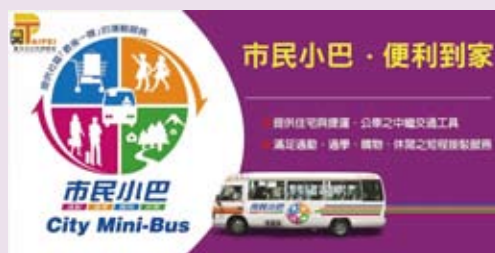
Citizen Mini Bus promotion poster.

In order to relieve traffic congestion in the Taipei Main Station Designated Area due to an over-concentration of long-distance bus routes, Taipei City established four new inter-city bus transfer stations—the Taipei Bus Station, Taipei City Hall Bus Station, Taipei Zoo Bus Station, and Yuanshan Transit Plaza—and is planning a fifth