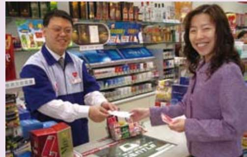
Convenience store processing of license renewal fees.

On January 1, 2010, the Taipei Motor Vehicles Office fully implemented a compulsory system for