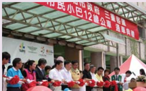
Ribbon-cutting ceremony for the service launch of the M12 Citizen Mini Bus.