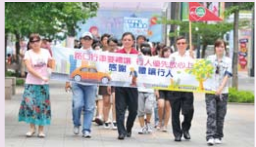
Pedestrian right of way promotion.

Taipei City designated 2010 as “Pedestrian Right of Way” year. Over the year, the city carried out a pedestrian right of way campaign on four levels—enforcement, education, promotion, and engineering—to encourage drivers to respect pedestrian road rights, promote the concept of pedestrian right of way, and firmly infuse such concepts in driver behavior and habits to establish a high-quality driving culture and create a more friendly city environment. On the enforcement level, the city stepped up policing of violations of pedestrian right of way and pedestrian rules. As for education, the city enhanced traffic safety education at schools at various levels and arranged over 10 safe-driving classes that were taught by professional drivers and attracted 894 participants. The promotional level involved participation in various outdoor promotional activities held by the Taipei City Government, the arrangement of a touring activity to promote traffic safety, the production of pamphlets, short videos and other materials on pedestrian right of way, and the inclusion of pedestrian right of way questions in safe driving and road safety classes and written test question databases. On the engineering level, worn down intersection crosswalk lines were re-painted, and the lengths of pedestrian crossing green lights in school areas were adjusted for certain times to provide a more barrier-free transportation space.