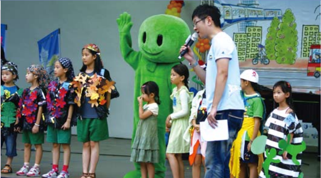
A different kind of green-light pedestrian figure puts on a show.

vests were also provided to volunteer crossing guards, guides, attendants at parking lots in the Xinyi Planning District vicinity, and other transportation assistance personnel to increase their visibility and safety.