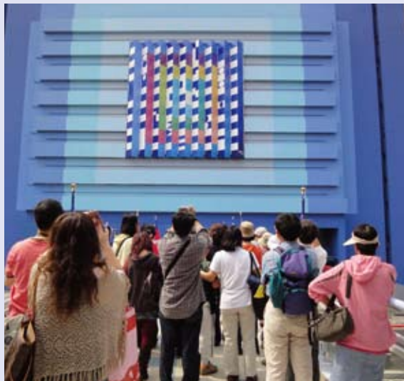
PA Tour introduces Israeli artist Yaacov Agam’s Heart of the Fountainhead, a work of public art in Taipei’s Gong Guan district.

To enrich the diversity of public art forms, the Department of Cultural Affairs, Taipei City Government has worked with private interests on related programs, including the 2010 Guandu International Outdoor Sculpture Festival, the Eastern Taipei Contemporary Art Exhibition, A Good Time Art Festival, the 2010 “Public Art, Mass Transit and City Image” Public Art Symposium, Wow! Giant Dinosaurs - Paper Windmill Dinosaur Art Expo, and the Art with Mountain – Land Art Installation Exhibition.