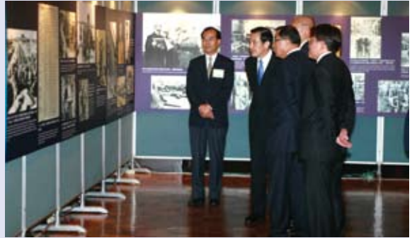
President Ma takes the time to visit the exhibition.

qipao Chinese gowns from various periods, the last signboard for Shanghai-style bathrooms displayed in the city market, three movies from old Shanghai, and numerous artifacts and mementoes provided by the many old Shanghai shopkeepers in Taipei. Other featured events included a lecture on Old Shanghai in Old Taipei, Old Songs on 78 RPM Phonographs, Taipei. Shanghai WALK Taipei City Guided Tour, and Old House Cinema-Old Shanghai Movie: Viva My Wife, telling the stories of Old Taipei and Old Shanghai from various avenues.