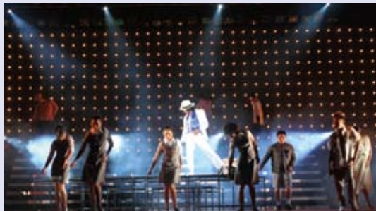
Shakespeare's Wild Sisters perform Michael Jackson at the Taipei Arts Festival

The lineup of performances at the 12th Taipei Arts Festival featured three international and six domestic events, 47 paid admission performances admission, and numerous lectures and interpretive activities, drawing attendance of nearly 220,000 persons. Of particular note, the Taiwan New Cultural Movement Memorial Hall and All Music Theatre Company teamed up to present five performances of the melodrama "The Impossible Times" from September 10 to 12 at