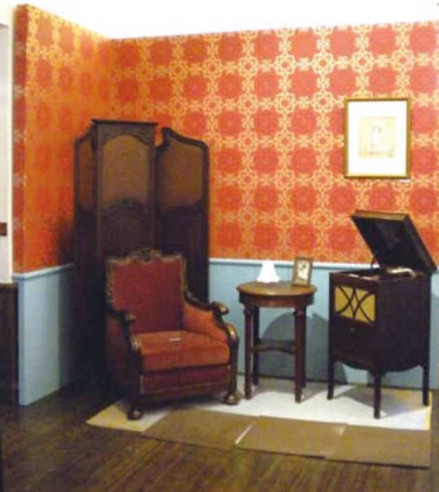
Second floor gallery at the “Memories of Old Shanghai in Taipei Special Exhibition.”