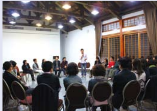
Mayor’s residence operators share their experiences.