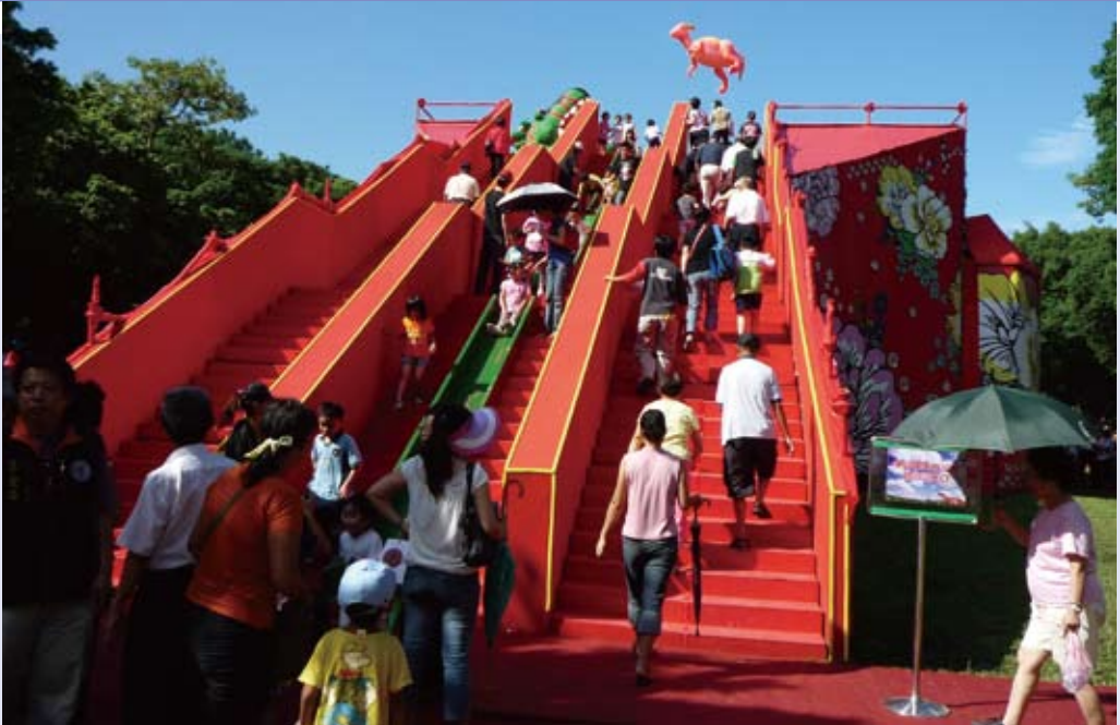
A slide designed into Giant Dinosaurs - Paper Windmill Dinosaur Art Expo adds an extra dimension of fun.