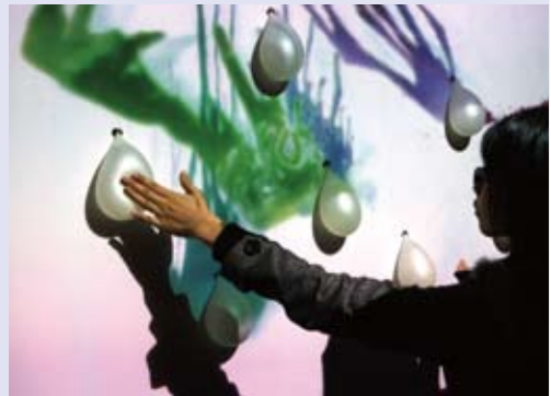
K.T. Creativity Award interactive work, Crazy About Color .

The Department of Cultural Affairs, Taipei City Government and the Taipei International Jazz Education