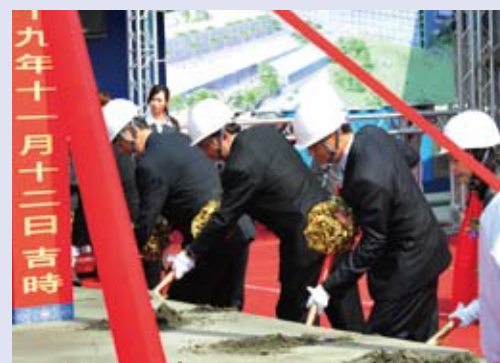
Songshan Tobacco Plant Culture Garden groundbreaking.