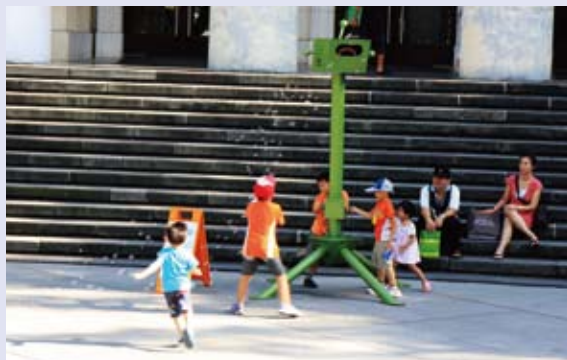
Children delight at works of public art.