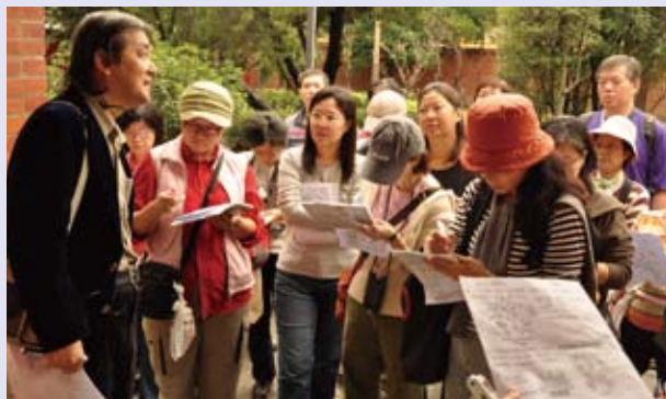
A tour of the Confucius Temple offers insight into traditional architecture.

Performing Arts School 36 joined arts groups in the Wenshan District to present one of the community’s major events of the year with the 4th Wenshan Arts Festival. Featuring numerous events between October 2 and November 29, it was