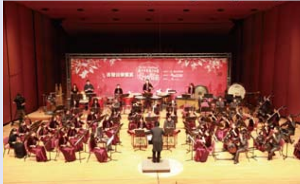
The Taipei Chinese Orchestra presents A Feast of Hakka Music.

The 2010 Taipei Hakka Cultural Festival presented two performances of Great Hakka Drama combining traditional subjects and modern theatrical concepts from September 23 through December 4. “An Evening of Hakka Mountain Songs” expressed the purest emotional Hakka energy; “A Feast of Hakka Music” featured all-new interpretations of traditional Hakka folk songs by the Taipei Chinese Orchestra; Hakka Arts & Culture invited professional performance groups to present their renditions of Hakka songs of different styles and eras, and the “Flowering of New Hakka Arts” design contest encouraged young people to apply their creative ideas and develop a Hakka brand arts industry.