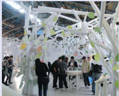
The 2010 Taiwan Design Expo.

Under the cooperative planning efforts of the Taiwan Design Center and Taipei New Horizons Co., Ltd together with the Taipei City Government, the richly historic Songshan Tobacco Plant will be the site of world-class green architecture and historical landmark that will attract and coalesce the cultural and creative industries and become a prominent Taipei icon.