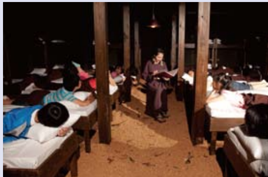
Listening to stories while lying in bed = FUN!

The 11th Taipei Children's Arts Festival was held from July 8 to August 7, 2010. An adaptation of Buchettino, by the Societas Raffaello Sanzio of Italy, which let audience members listen to bedtime stories while lying in bed, was especially well received. The event featured 62 admission-only performances, four outdoor performances, 83 community arts performances, 430 lectures and workshops, and 132 animation showings, drawing attendance of 260,000.