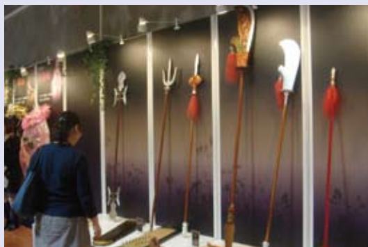
A permanent exhibition of Ming Hwa Yuan Art & Cultural Group costumes and props is in the works.

"A Century of Sugar Warehouse – Arts in the Air" was held on November 20, 2010, as a pre-launch event for the operation of the Taiwan Sugar Company Taipei Warehouse, designated as Taipei's one hundred and sixth historical landmark, in new form as the Cultural Zone Tangbu. Three of the warehouses on the premises of the old sugar mill hosted sugar warehouse opening special exhibitions, presenting an overview of the development of the sugar industry in northern Taiwan and the