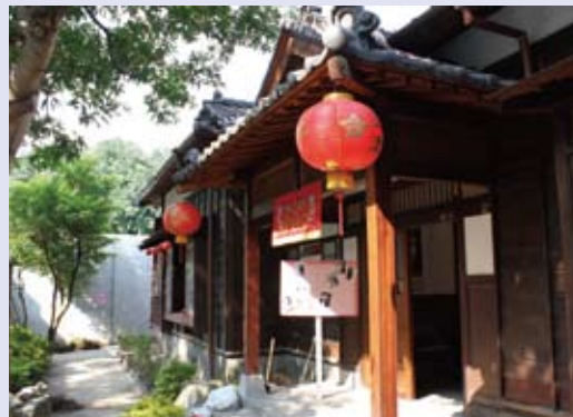
Following a complete restoration, the Qidong Street Japanese Housing site is open to the public.

The restored historical landmark at No. 11 Qidong Street Lane 53 and historical building at No. 12 Jinshan South Road Section 1 Lane 30 were opened to the public on November 21,