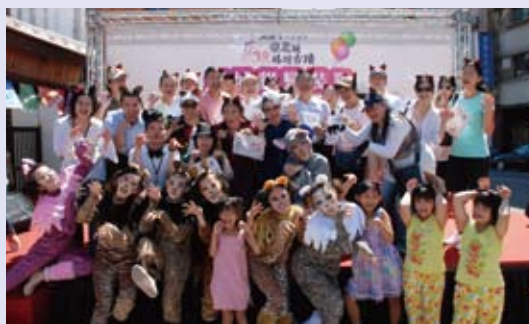
Taipei Touring Cats Costume Party and certificate presentation.

Taipei celebrated Historical Landmark Day with a variety of events, mobilizing citizens to form a band of Taipei City Touring Cats and