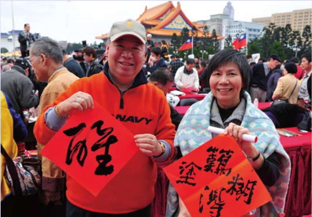
The Chinese Character Festival starts off 2010 with a flourish.

The 5th Taipei Military Dependent Village Cultural Festival was held from October 29 to 30 at 44 South Village and Youth Park. Performances of Village were presented in the authentic military dependant residential setting with no additional props or artifices, while the “My Military Dependant Village Special Exhibition” at the Youth Park Reading Room presented a collection of old photographs from military dependant villages in the Wanhua District.