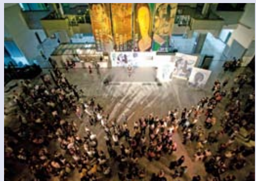
Opening of the Manet to Picasso-Masterpieces from the Philadelphia Museum of Art exhibition.

The Philadelphia Museum of Art is renowned for its collection of nearly 225,000 works of art, most notably a rich body of Impressionist and post-Impressionist works by Picasso, Matisse and