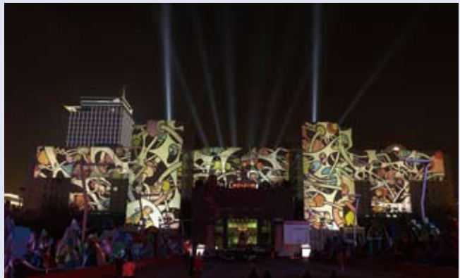
Taipei Lantern Festival Public Art, Flower of the Universe

In the celebratory spirit of the 2010 Taipei International Flora Expo, the 2010 Taipei Lantern Festival presented public art at Taipei City Hall for 10 days starting on February 26, 2010, punctuated throughout by the year’s Chinese zodiac sign, the Happy Tiger. Combining music, a large light and sound arts spectacle in three parts including Youth Flowers, Taiwanese Flowers, and Universal Flowers, the virtual robot character LuLubo created by contemporary artist Lee Ming-tao based on the works of self-taught Taiwanese artist Hung Tung, and the avant garde cyberpunk paintings of new-generation artist Hsu Tang-wei, the presentation brought together traditional, contemporary, and surreal styles to lend the Taipei Lantern Festival a timeless feeling transcending different eras.