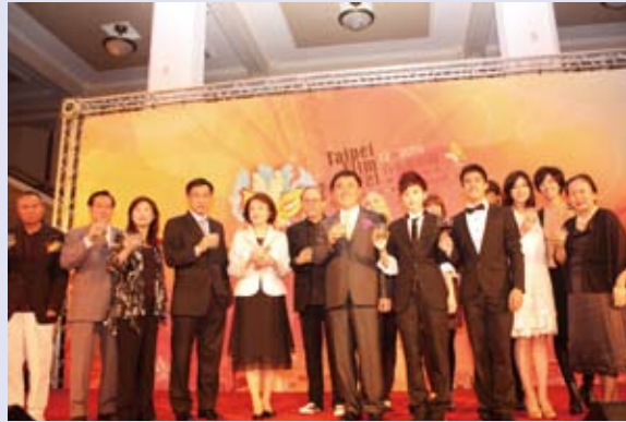
Taipei Film Festival opening reception

The Taipei Film Festival, positioned as an urban film festival, was held from June 25 to July 15, 2010 at multiple venues across town including Zhongshan Hall, Shin Kong Cineplex, Governor Cinema, The Red House, and the Taipei Cinema Park. The featured city for this edition of the festival was Brazil's Rio de Janeiro, drawing a total of over 30 entries and including works from many of the country's top directors to present an in-depth look at the modern and classical, unhindered style, and fantastical aspects of Brazilian cinema.