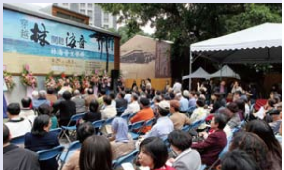
Opening of the Lin Hai-yin Literature Exhibition, the inaugural event at the New Kishu An.