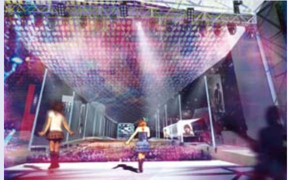
Taipei Pop Music Center schematic layout.

of Cultural Affairs, Taipei City Government constructed a new three-story building on the north side of the site as Taipei’s center for literature promotion. The inaugural event at the New Kishu An, “Listening to the Sea Across the Forest – Lin Hai-yin Literature Exhibition,” was held on April 28, 2010, in celebration of this highly respected literary pioneer. The event was attended by over 120 members of the literary community, including such luminaries as Lin Liang, Ya Xuan, Yin Di, Lin Wen-yue, and Zhang Xiao-feng. The exhibition