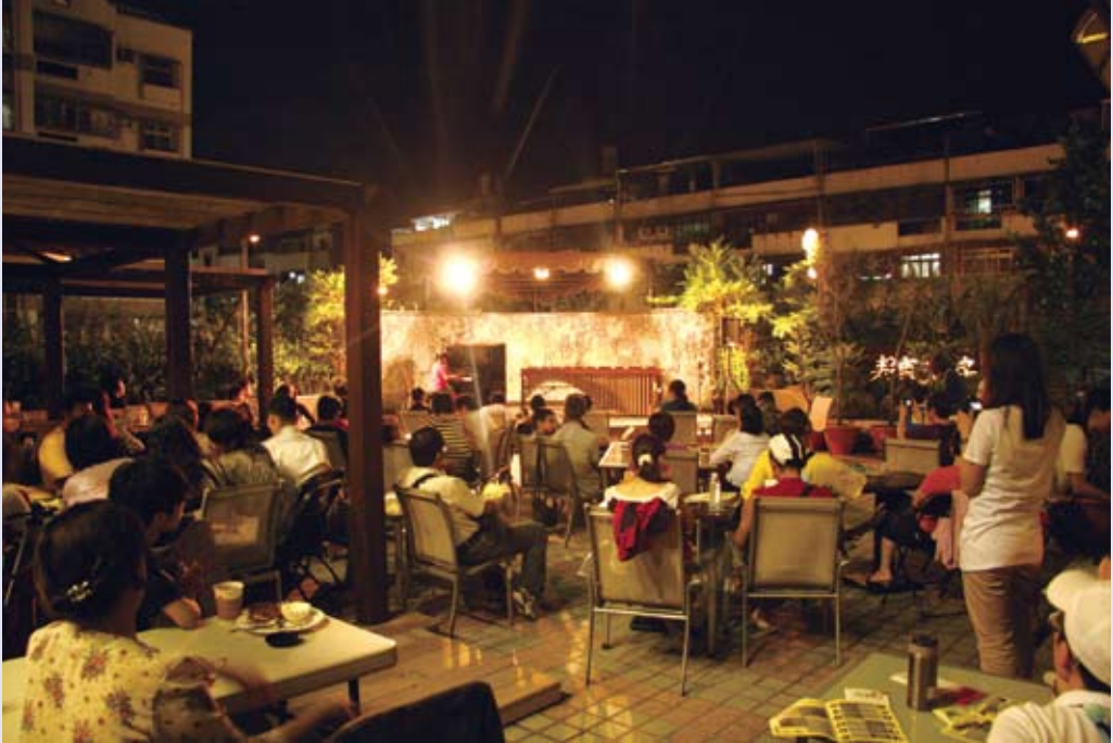
Performing Arts School 36 in action at the Yongan Arts Center.

enthusiastically embraced by Shih Hsin University, the National Chengchi University Arts Center, and Zhongshun community members.